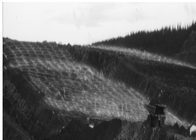
A weak cyanide solution sprayed onto a heap.

In a heap leach operation, a very dilute cyanide leaching solution is sprayed or dripped onto ore stacked on an impermeable pad. As the solution percolates through the heap, precious metals are complexed with the cyanide ion and dissolved. Depending on the height of the pad and grain size of the ore, it can take anywhere from thirty days to several months for the solution to make its way by gravity through the heap. The pregnant solution is recovered, and the precious metals are concentrated with activated carbon. After stripping and electroplating processes, the resultant sludge is filtered, dried and smelted into gold/silver bars. The barren solution (the solution that does not contain the precious metals) is recirculated, with cyanide being replenished continuously. The concentration of cyanide necessary to extract gold from the heap is dictated by characteristics of the ore. After a certain period of leaching, it is no longer economical to continue leaching residual gold from a heap, and the heap is closed. Residual cyanide remains in the heap