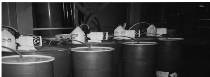
Column tests of cyanide degrading bacteria using various concentrations and growth conditions at the Brewery Creek Mine.

In the Yukon, investigations were conducted at the Brewery Creek Mine near Dawson in 1999, to determine the potential of using cyanide-degrading bacteria as a treatment method in the heaps at abandonment. Cyanide-degrading bacteria were found to be widespread in the local area and were cultured. The bacteria were placed in columns containing cyanide treated ore, representative of spent ore that would remain on the heap leach pads at closure.