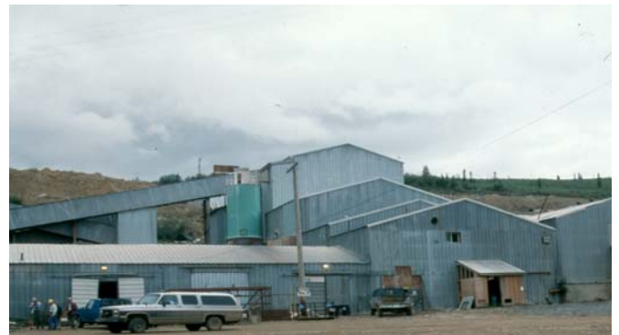
A Yukon mill where cyanide was used to recover gold.

The form usually used in mining is sodium cyanide (NaCN), which is stable in solid form.