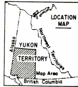
LOCATION MAP SHOWING AREA COVERED BY RECONNAISSANCE GEOCHEMICAL STREAM SEDIMENT SURVEY 1970 - 1971