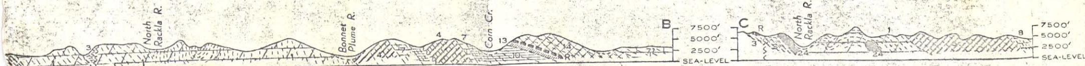
DIAGRAMMATIC CROSS-SECTIONS A