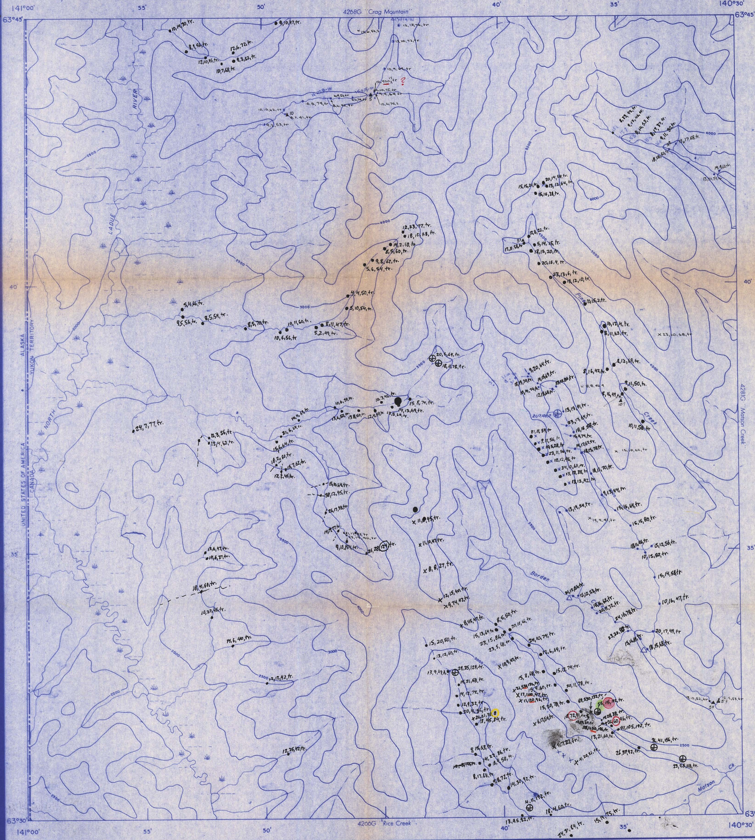
MAP 4267 G