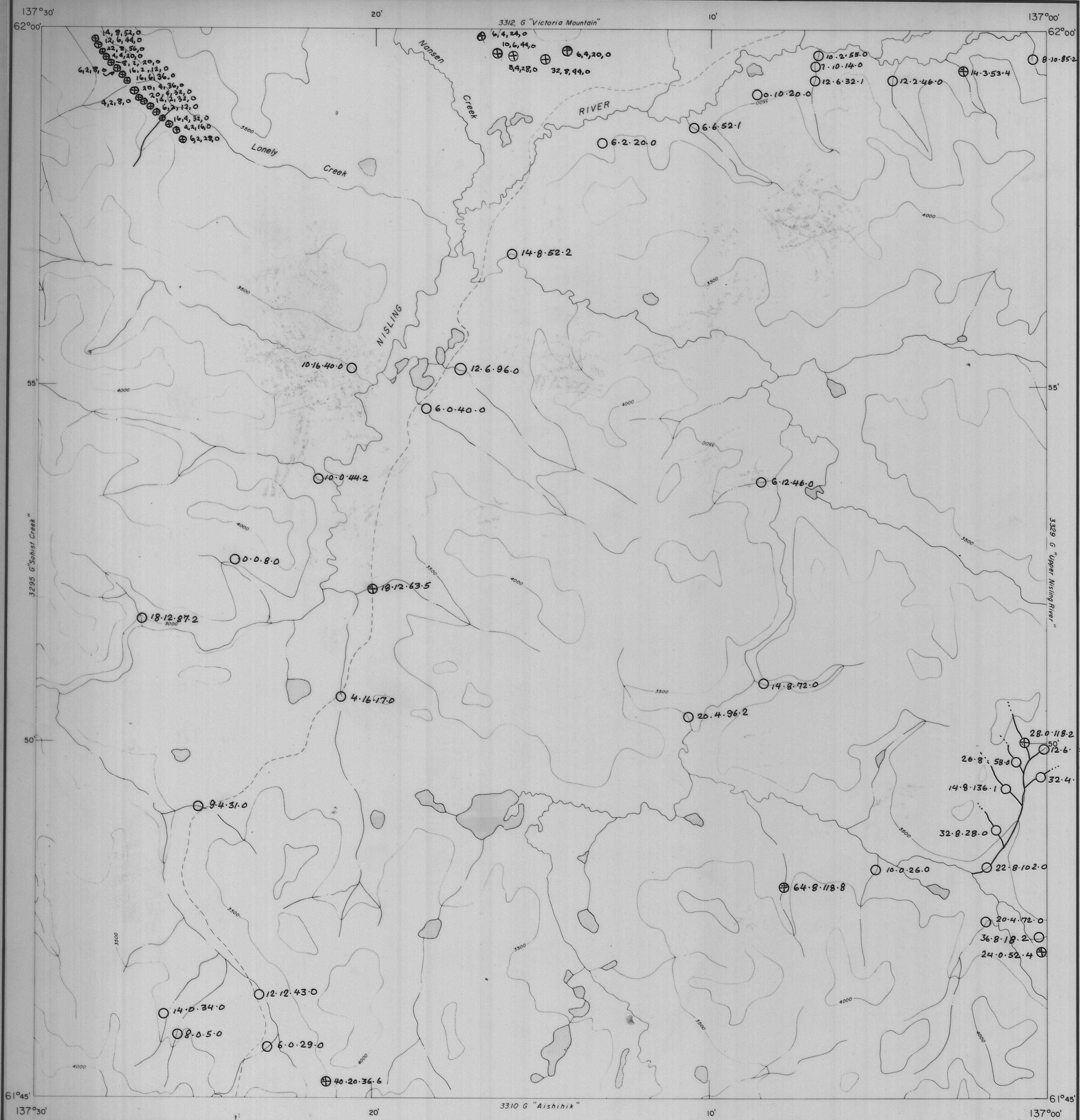
MAP 3311 G