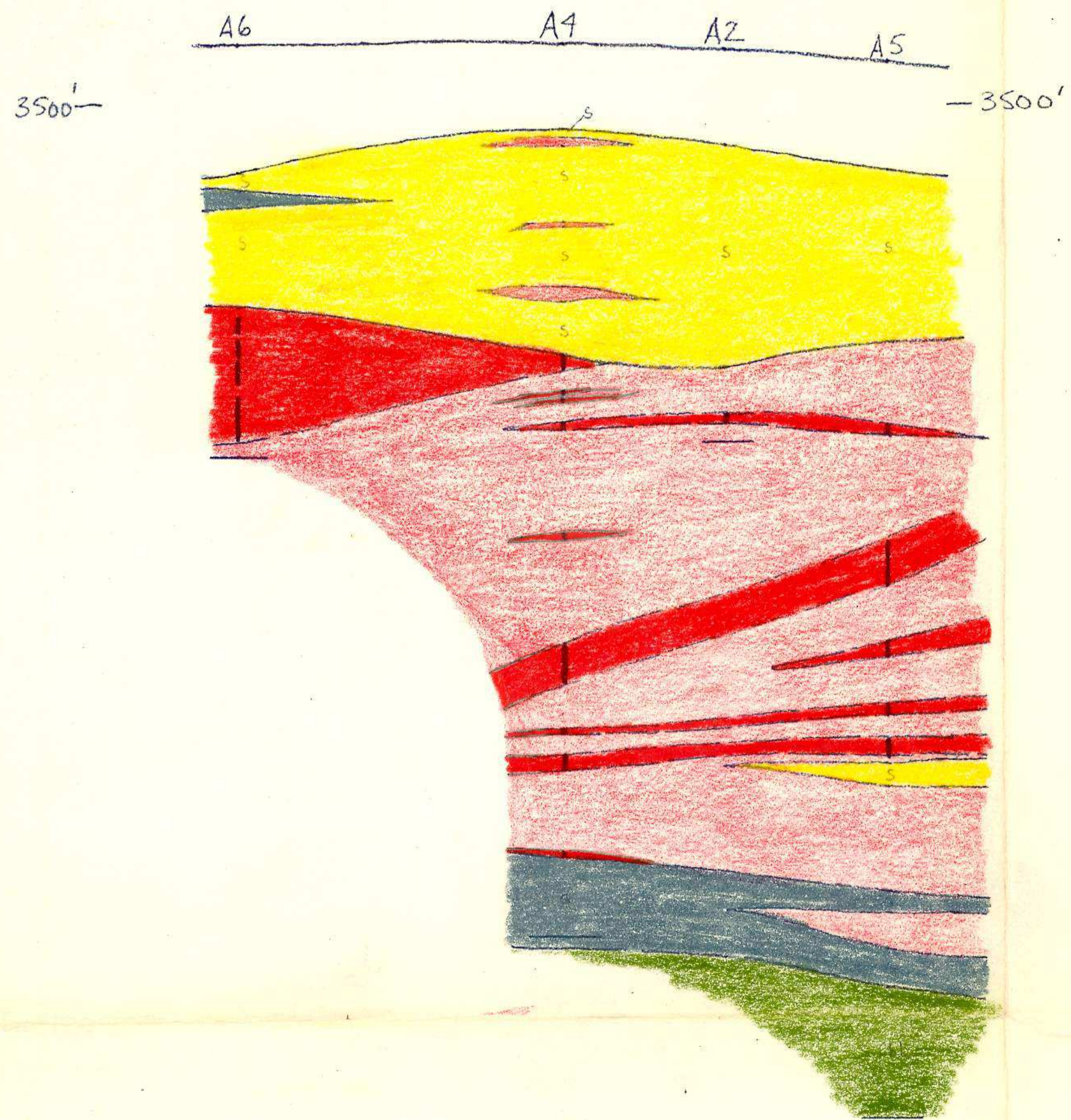
LONGITUDINAL GEOLOGIC CROSS-SECTION COMPILED FROM DRILLING AT SWIM LAKES - VIEW LOOKING NORTHEAST -