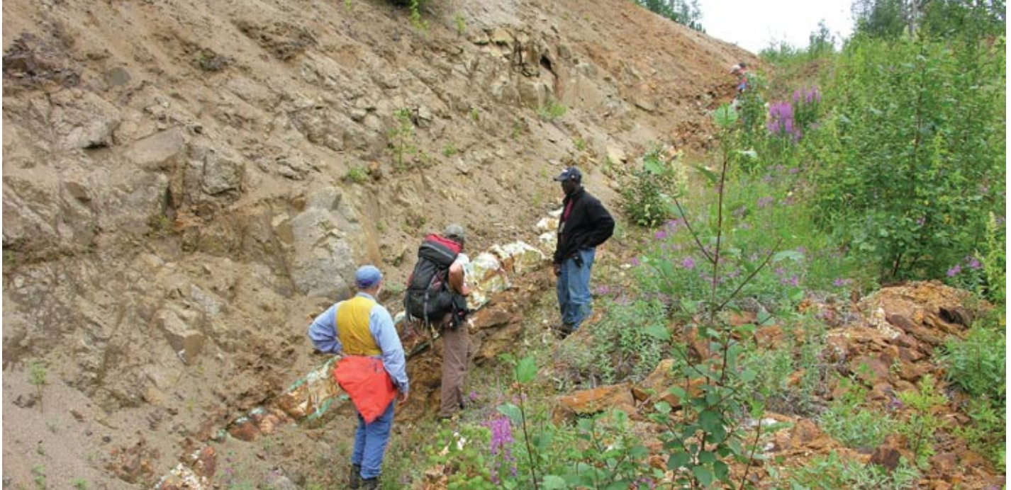
The Number 3 gold-bearing quartz vein at the Longline property, Mountain Rio Resources.