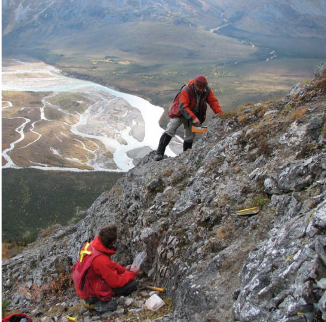
Working with a scintillometer at the Slab Mountain copper-uranium Wernecke Breccia property.

The Yukon's royalty system for hardrock mines is based on a percentage of mine profits. The rules are clearly defined in legislation and based on a sliding percentage scale tied to the mine operation's