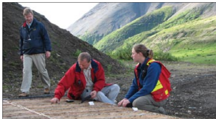
Selwyn Resources' drill core at Howards Pass property.