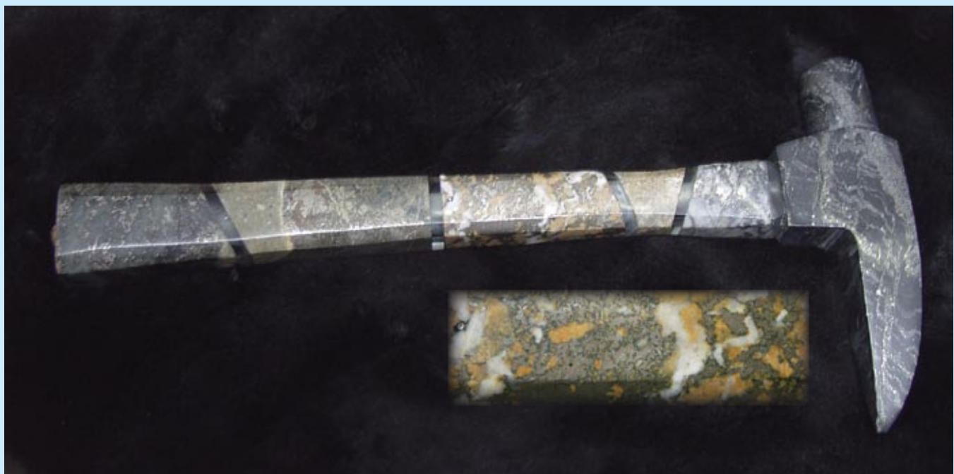
Rock sculpture hammer by Rick Zuran. Inset: Gold-bearing quartz-carbonate-sulphide manto ore from the Ketza River mine.