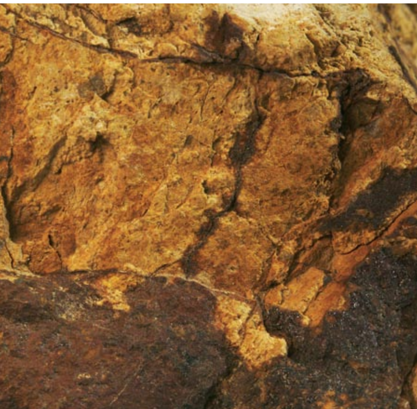
Gold oxide ore from the Brewery Creek mine.