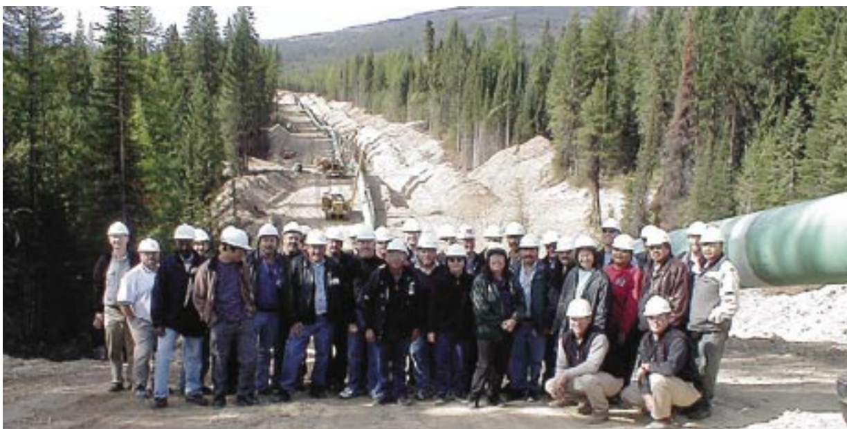
Yukon businesses and First Nations take a tour of a pipeline near Fernie, B.C.