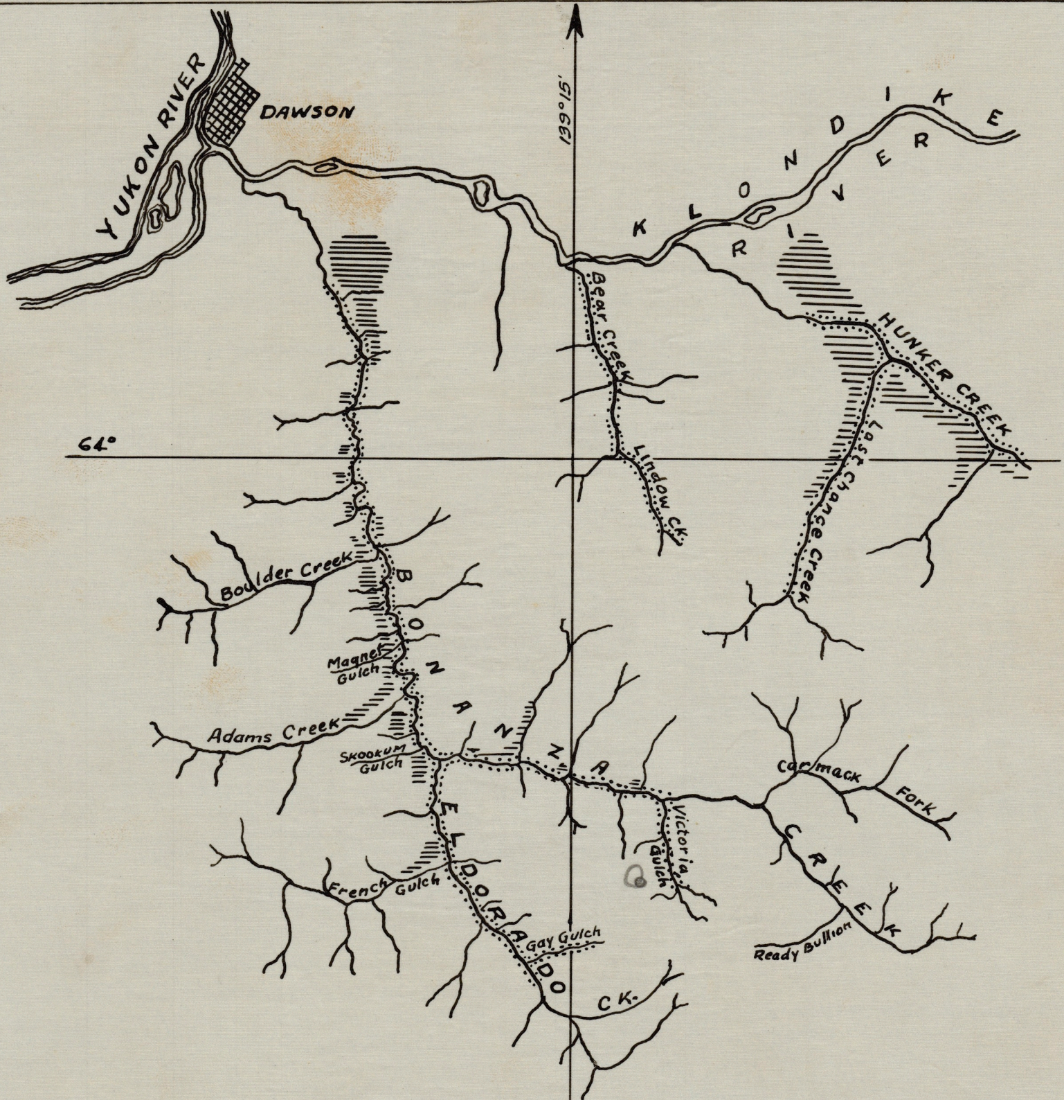
MAP OF PART OF THE KLONDIKE GOLD FIELDS SCALE 1 IN. = 2 MI.