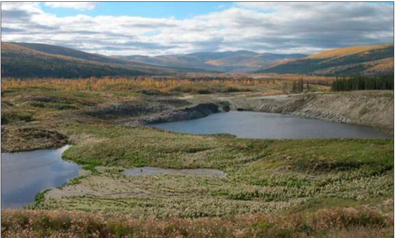
Figure 3. View of Gimlex Enterprises' property on Dominion Creek. Notice the naturally revegetating ponds and contoured slopes.

Gimlex Enterprises is a great model for this industry and for ongoing reclamation.