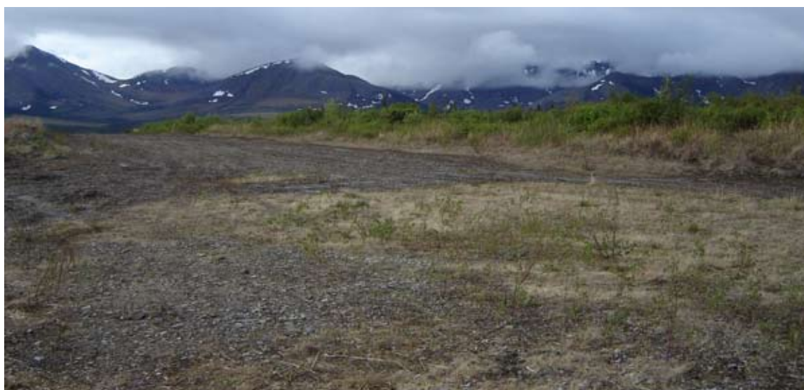
Figure 1. View of the airstrip at Rusty Springs post reclamation.

Eagle Plains is a very worthy recipient of this award!