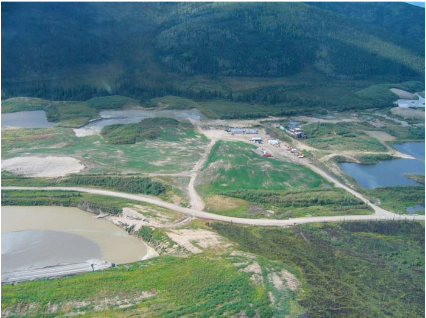
Figure 4. Steep structures have been recontoured to low-relief angles, and vegetation is flourishing from the addition of overburden spread on the surface.

The work A-1 Cats has done on the previously mined portion of the property has improved and accelerated the reclamation potential of this site.