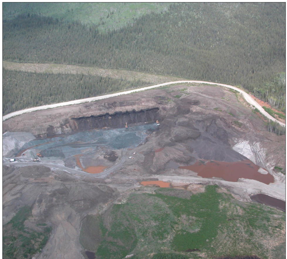
Gimlex Enterprises Ltd.'s operation on Dominion Creek in 2004.

WORK HISTORY AND MINING CUTS The Christie family mined on Dominion Creek from 1994 to 2004. In 2003, a large new pit was opened up adjacent to the Dominion Creek road. Black muck was stripped hydraulically and pushed aside with