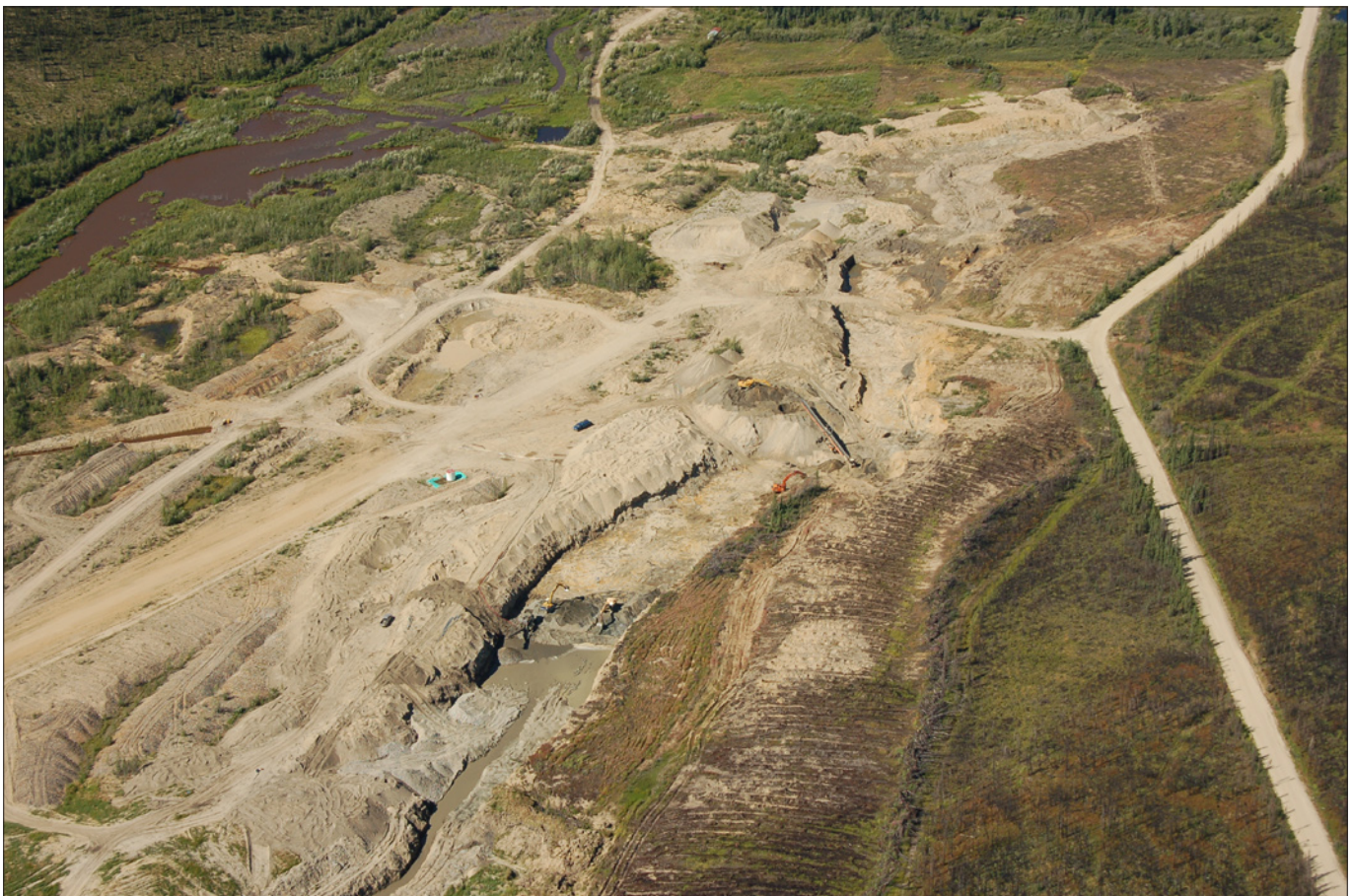
Aerial view of Adrian Hollis operation, Dominion Creek, 2006.

From 2 to 6 feet (1 to 2 m) of bedrock were sluiced. In 2004, the section consisted of interbedded thawed muck