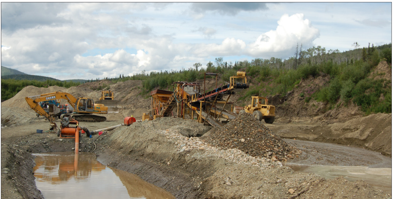
Alberta Gold Diggers Ltd.'s operation on Gold Run Creek, 2006.

EQUIPMENT AND WATER TREATMENT Equipment included a Caterpillar D9G bulldozer, a Caterpillar D8H bulldozer, a Caterpillar 966C loader and a Caterpillar 235 excavator. The wash plant was a 4-yard hopper with a belt feeder, which fed to a 4 by 10-foot double screen deck. The screen deck