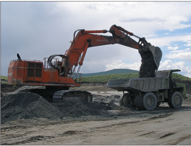
Loading pay at Ross Mining's operation, Dominion Creek, 2005.

cut totalling 1,080,000 square feet (100 300 m 2 ); the 2004 mining cut totalling 980,000 square feet (91 000 m 2 ); the 2005 mining cut totalling 1,110,000 square feet (103 000 m 2 ) and the 2006 mining cut totalling 1,200,000 square feet (110 000 m 2 ).