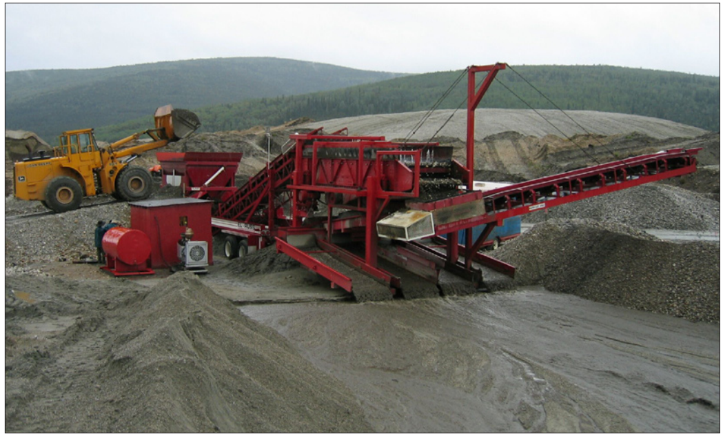
Gatenby Mining's wash plant, Dominion Creek, 2004.

BEDROCK GEOLOGY The bedrock was described as decomposed chloritic schist with cross-cutting quartz veins.