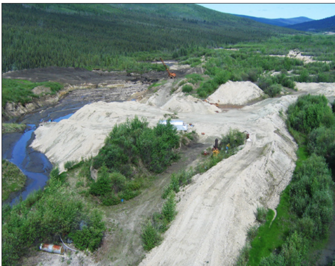
Henry Kruger's pit and dragline on Sulphur Creek, 2005.

SURFICIAL GEOLOGY AND STRATIGRAPHY The stratigraphic section consisted of 15 feet (5 m) of frozen black muck overlying 15 to 20 feet (5 to 6 m) of various gravel layers. These gravel units had 'White Channel' rocks, oxidized rounded rocks and flat slide rocks, and were comprised of a 4-foot (1-m) rusty layer, a 4-foot (1-m) yellow layer and a 4-foot (1-m)