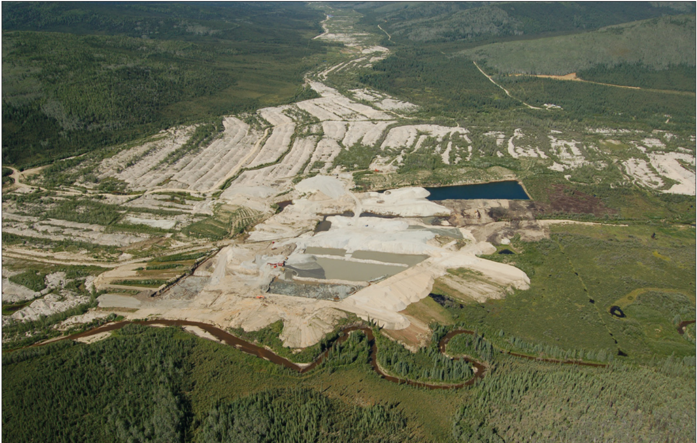
Aerial view of Gatenby Mining's operation, Dominion Creek, towards the northwest, 2006.

EQUIPMENT AND WATER TREATMENT Equipment between 2003 and 2006 consisted of Caterpillar D9L and Caterpillar D8H bulldozers with U-blades and rippers; a Kawasaki 957 III loader with a 7½-cubic-yard bucket, and a John Deere 844 loader with a 5½-cubic-yard bucket. Two Hitachi excavators