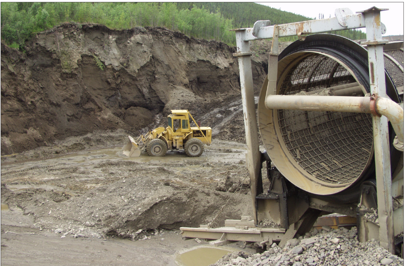
Richard Allen's operation on Stowe Creek, 2003.

SURFICIAL GEOLOGY AND STRATIGRAPHY The section consisted of 15 to 30 feet (5 to 10 m) of black muck and silt overlying 1½ feet