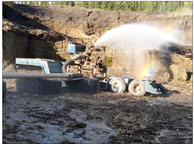
Lance Gibson's automatic monitor on Sulphur Creek, 2003.

grey layer on bedrock. From 15 to 20 feet (5 to 6 m) of gravel were sluiced along with ½ to 1 foot (0.2 to 0.3 m) of bedrock.