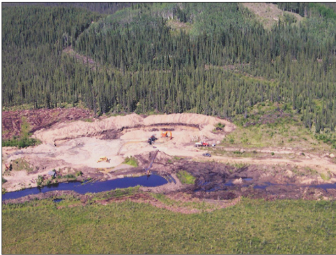
19651 Yukon Inc. (Vern Matkovich) operating on Montana Creek, 2003.

SURFICIAL GEOLOGY AND STRATIGRAPHY In 2003, the section consisted of 6 feet (2 m) of silt and organic material overlying 3 to 6 feet (1 to 2 m) of subangular sandy cobble pay gravel. Wood in the overlying silt was carbon dated at >45 800 years old.