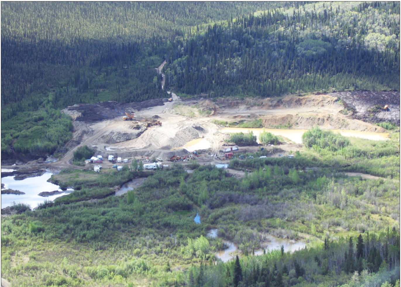
Jim Conklin's operation at the mouth of Hunter Creek on Dominion, 2005.

EQUIPMENT AND WATER TREATMENT From 2003 to 2006, equipment consisted of a Caterpillar D9H bulldozer for stripping, a Michigan 175B loader for feeding the wash plant, and a Bucyrus Erie 350 excavator for digging pay and stripping. An International 350 rock truck with a 45-cubic-yard capacity was added for hauling pay in 2004. The wash plant was a 4- by 8-foot screen deck with ¾-inch punch plate and four 8- by 4-foot oscillating sluice runs lined with expanded metal and Nomad matting. Water for the plant was supplied at 800 igpm by a Gorman Rupp 6-inch pump powered by a 4-cylinder Perkins engine, and from 80 to 100 loose cubic yards per hour were processed. Water was supplied by an intake on Hunter Creek and effluent was settled out-of-stream and 100% recycled from two ponds,