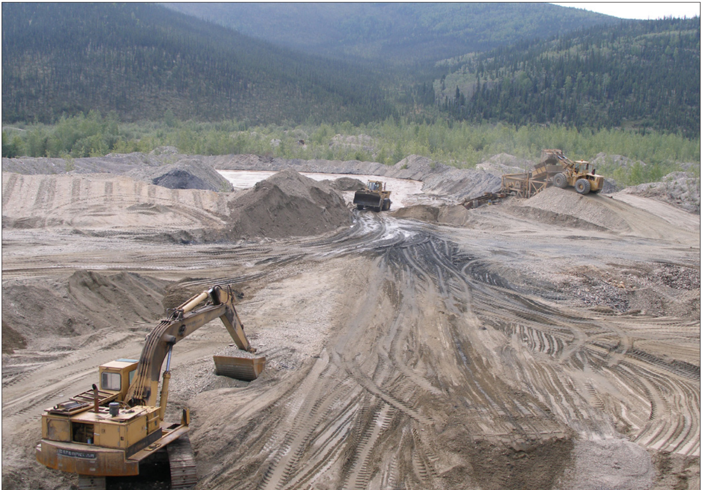
Art Sailer's operation on Dominion Creek, 2005.

WORK HISTORY AND MINING CUTS The Sailer family has been working on their various properties on Dominion Creek and tributaries since 1990. The crew from 2003 to 2006 consisted of six miners and one camp person working a daily 10-hour shift. In 2003, five cuts were stripped and sluiced on Dominion at the mouth of Champion Creek, with an approximate volume of 198,000 cubic yards (150 000 m 3 ). In