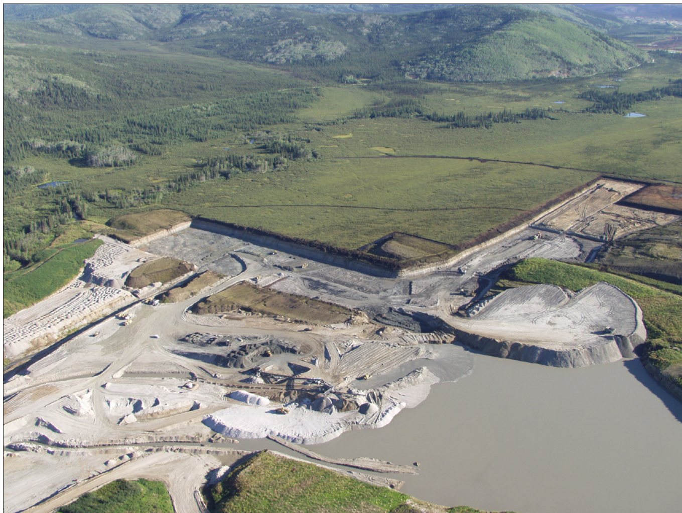
Aerial view of Ross Mining Ltd.'s pit on Dominion Creek, 2004.