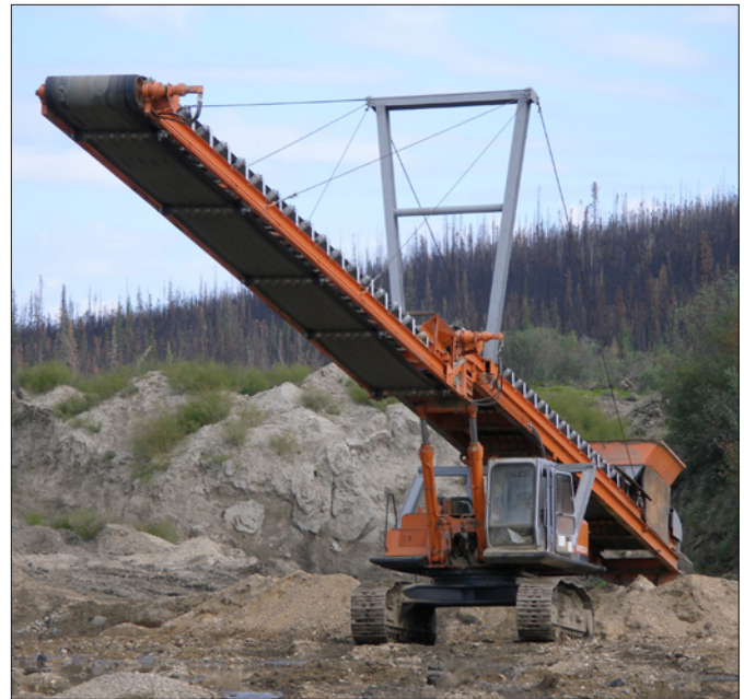
Adrian Hollis' track-mounted tailings stacker, Dominion Creek, 2005. This conveyor can move 500 yd 3 per hour.

SURFICIAL GEOLOGY AND STRATIGRAPHY In 2003, the section consisted of 20 to 25 feet (6 to 8 m) of black muck overlying bedrock.