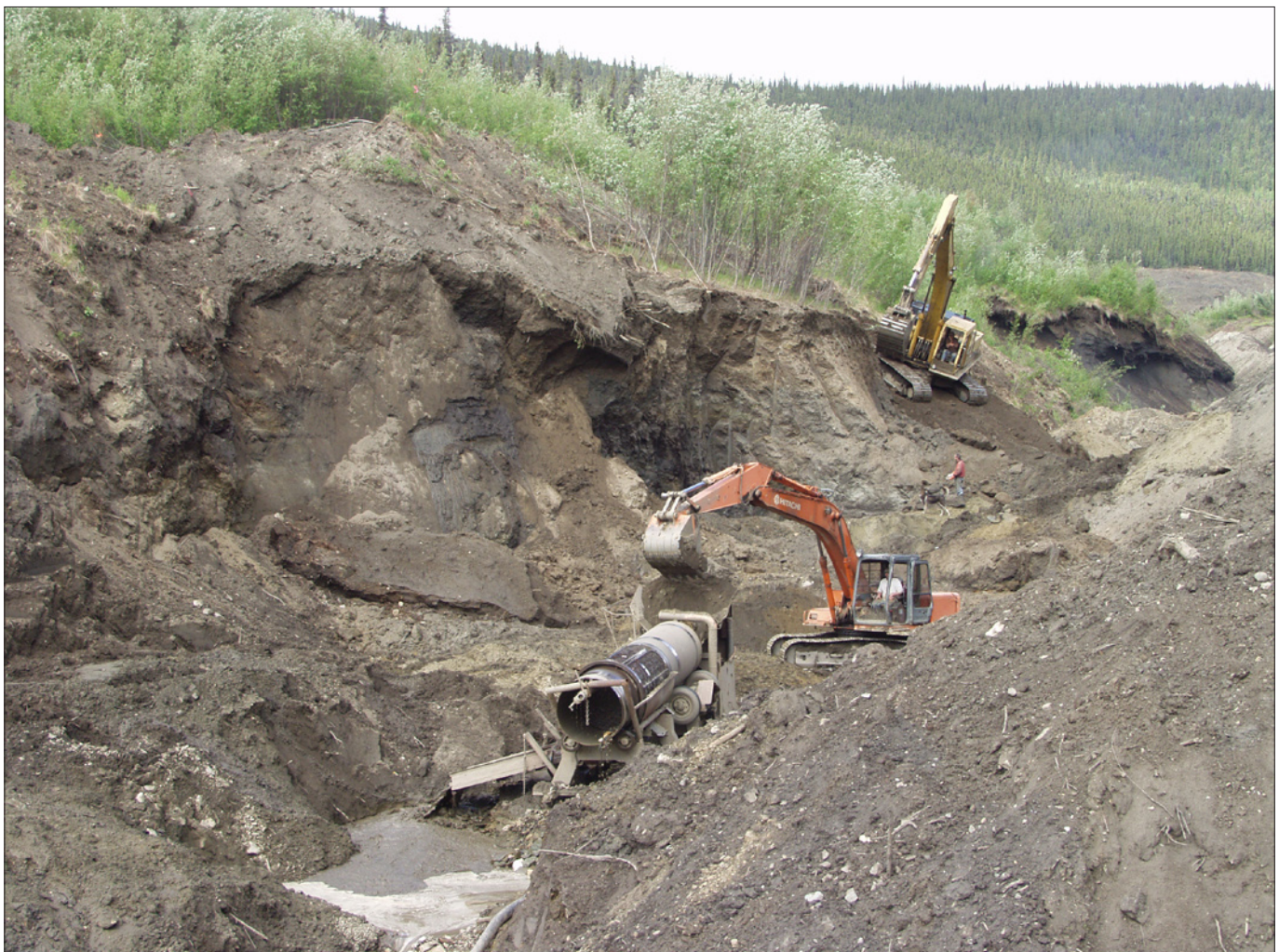
Tim Coles' sluicing operation on Upper Dominion, 2004.

GOLD CHARACTERISTICS From 2003 to 2005, gold was reported to be coarse, jagged and not very pretty. Approximately 1% was dendritic. The fineness was 770 to 790.