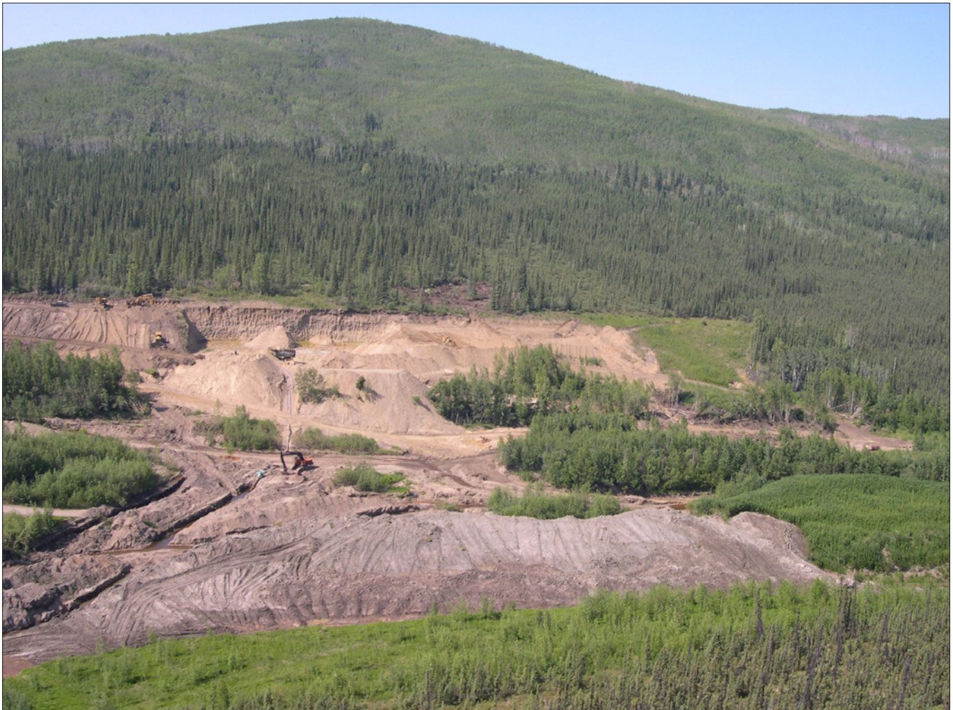
Eureka Placers' pit on the left-limit bench of the right fork of Eureka Creek, 2005.

SURFICIAL GEOLOGY AND STRATIGRAPHY In 2005, the stratigraphic section on the left-limit bench on the right fork consisted of 50 feet (15 m) of frozen washed gravel on wavy bedrock. The bottom 3 feet (1 m) plus 3 feet (1 m) of bedrock were sluiced.