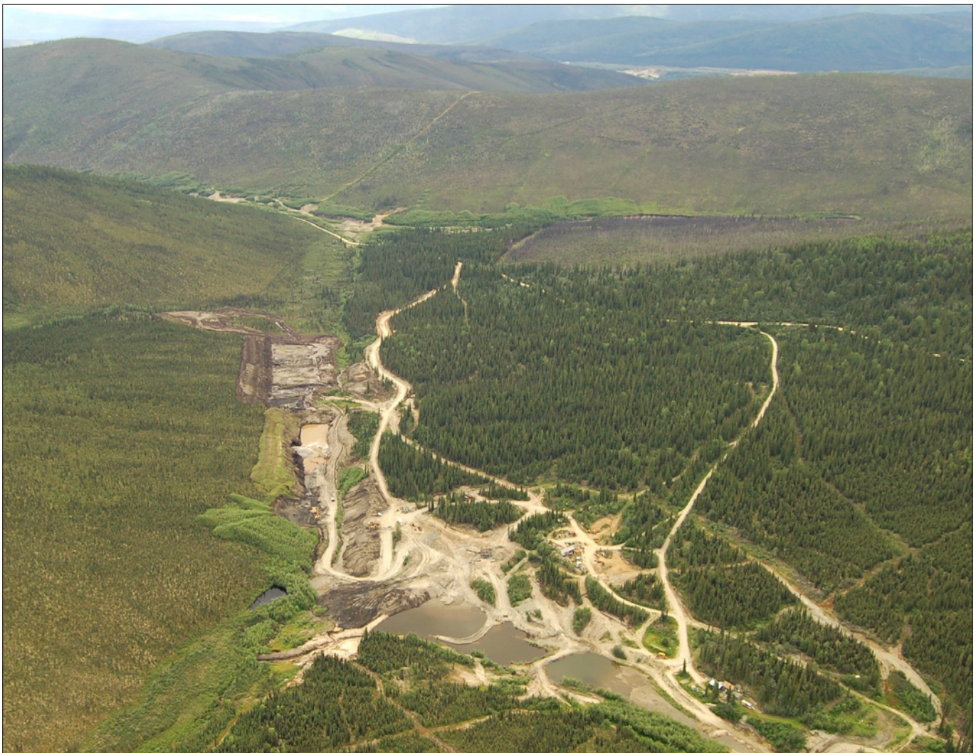
Coulee Resources Ltd's pit on Darrell Morgan's Green Gulch property; view to the southwest, 2006.

WORK HISTORY AND MINING CUTS Darrell Morgan began working at this location in 1979. Morgan's crew consisted of one to two miners working a five-hour shift between 2003 and 2005. Limited testing occurred in 2003. In 2004, some stripping occurred above Morgan's camp in a small area about 30 by 50 feet (10 x 15 m), and in 2005 a cut 100 by 100 by 30 feet (30 x 30 x 10 m) was stripped and mined. Sluicing this material took 50 hours. In 2005, some of this property was optioned to Coulee Resources Ltd., who mined a cut 700 by