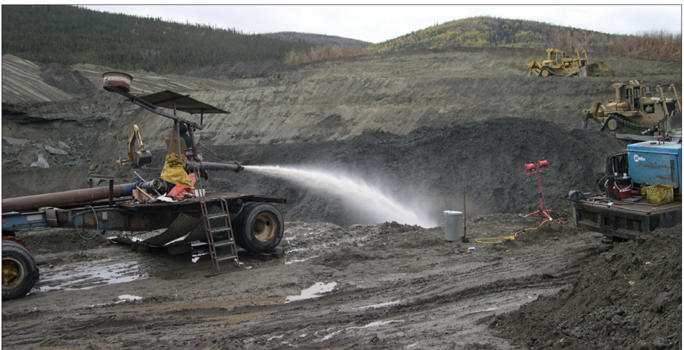
Mary Ange Resources Ltd. monitoring on Gold Run Creek, 2004.

WORK HISTORY AND MINING CUTS The owners were active here from 1993 to 2004, when the operation was sold to Alberta Gold Diggers Ltd. In 2003, two cuts were mined, 270 by 60 by