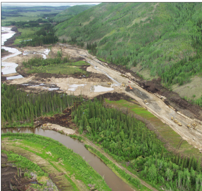
Tamarack Inc. operation on Indian River, 2004.

EQUIPMENT AND WATER TREATMENT Equipment on-site included an excavator and Caterpillar D8 bulldozer. The wash plant was a 3- by 10-foot double screen deck over an 8-foot by 32-inch sluice run equipped with angle iron riffles, which in turn fed two 8-foot by 24-inch sluice runs lined with expanded metal. A full recycle sluicing system was used with no discharge.