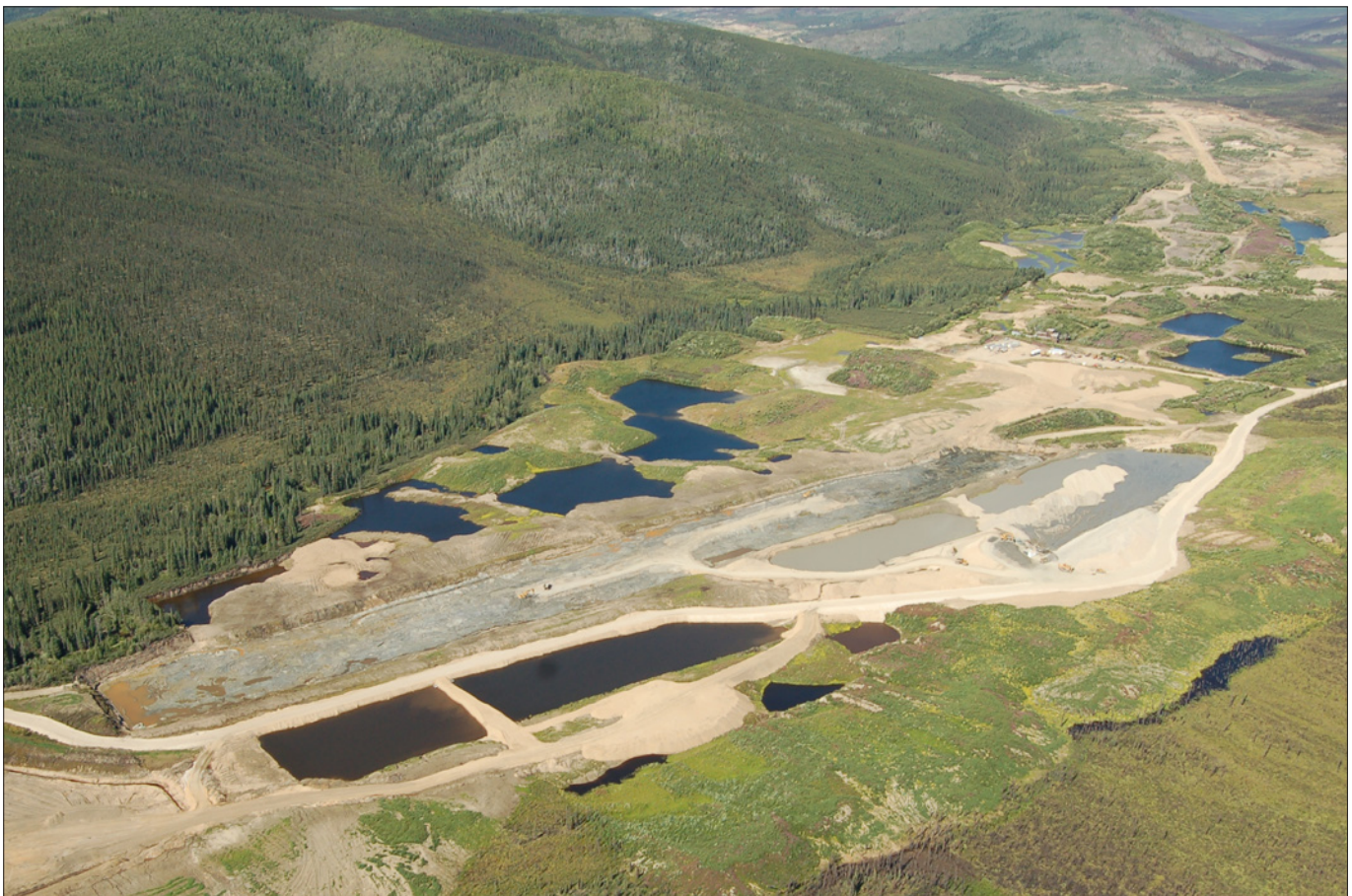
A-1 Cats/365334 Alberta Ltd.'s operation on Dominion Creek, 2006.

EQUIPMENT AND WATER TREATMENT In 2003, 2004 and 2005, equipment included two Caterpillar D11N bulldozers, one equipped with a 20-foot (6-m) U-blade and one with a 22-foot (7-m) U-blade and single-shank rippers which were used to strip overburden. A Caterpillar D9H bulldozer equipped with a U-blade and a ripper was used for fine and coarse tailings removal, road construction and maintenance, pay gravel stockpiling, and also assisted in the removal of overburden. A Caterpillar D8K equipped with a U-blade and winch was added for coarse tailings removal in 2005. Pay gravel was loaded into two Caterpillar 300B rock trucks by a Caterpillar 235C excavator and a second 235C excavator was used to load the wash plant. A third 235C excavator and a third 300B rock truck were available on-site as standby units and were also used for the disposal of thawed waste gravel. The excavators were utilized during the later stages of