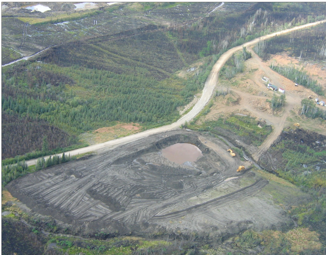
Stripping at Peter Bodin's operation on Kentucky Creek, 2005.

was recycled due to low flow. The pond doubled as a reservoir and settling facility and measured about 120 by 100 feet (35 x 30 m) in size.