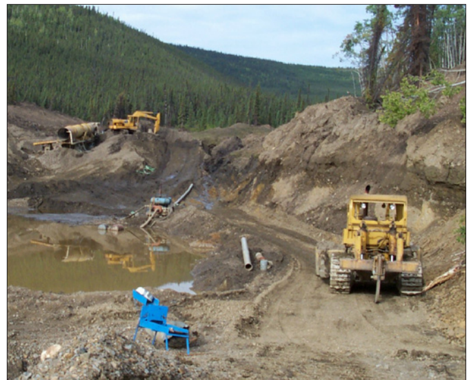
Hamar Placers operation on Eureka Creek, 2003.