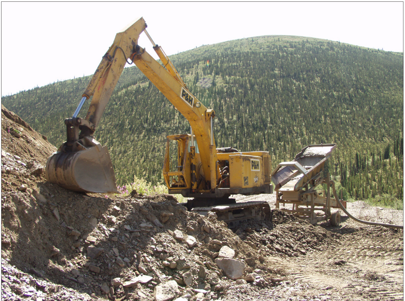
Floyd Travis' operation on Glacier Creek, 2003.

EQUIPMENT AND WATER TREATMENT Equipment included a P&H excavator and Komatsu P31 track loader to strip and move material. The wash plant was a 30- by 30-inch shaker screen