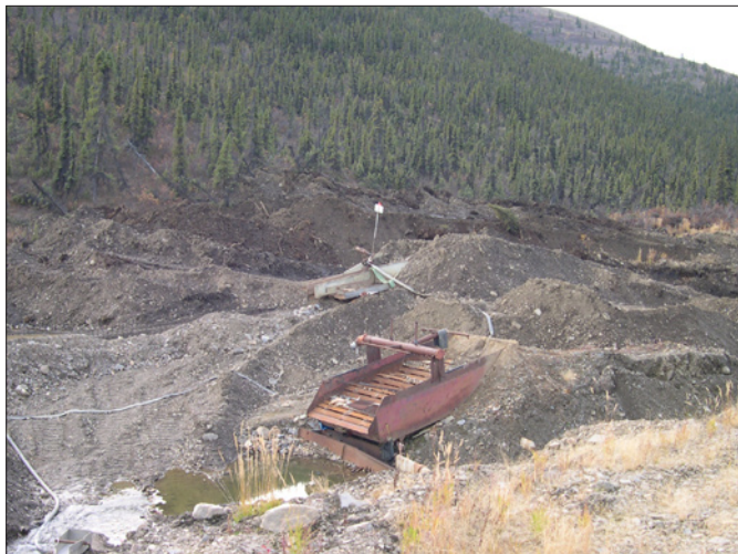
Dave and Sarah Laurenson's workings on Little Gold Creek, 2005.

EQUIPMENT AND WATER TREATMENT Equipment consisted of a Caterpillar D8H bulldozer equipped with a ripper and U-blade and a Terex 72-51 loader. Test sluicing was done with the wash plant which included a 10-yard hopper feeding into a 4-foot-wide by 14-foot-long double screen deck.