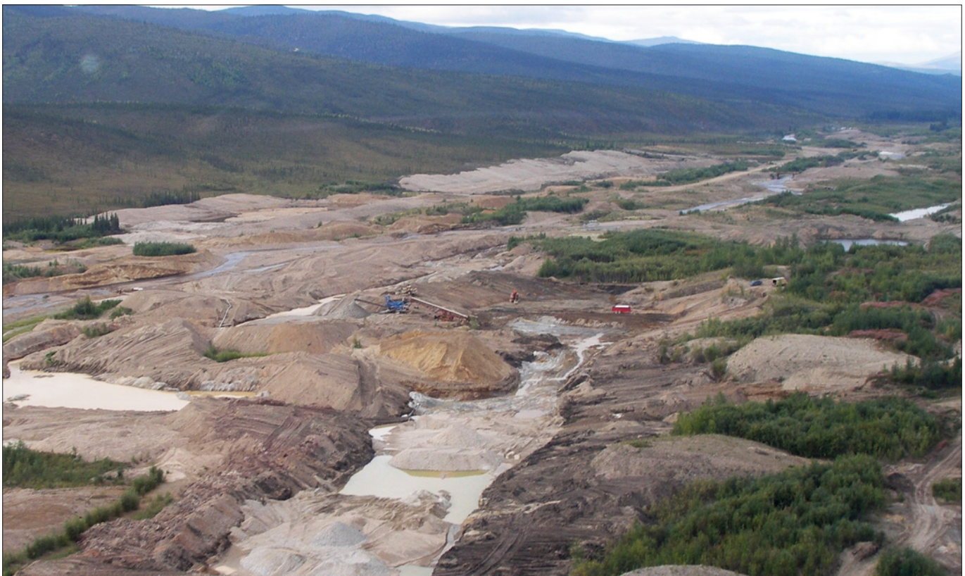
Midas Rex Mining Inc.'s operation on the Sixtymile River, 2005.

WORK HISTORY AND MINING CUTS Frank and Karen Hawker began mining on the Sixtymile River in 1993 and they mined in the area until 2005. In 2003, a crew of three miners and one camp person worked a daily 12-hour shift to mine seven cuts, each 100 by 300 feet (30 x 100 m). One cut was stripped on the left-limit bench for 2004. In 2004 and 2005, the crew of two miners and one camp person worked a daily 11-hour shift. In each of those years, a cut on Sixtymile River 1000 feet (300 m) long and 120 feet (35 m) wide was mined. One small cut on Miller Creek was mined in 2005. In 2006,