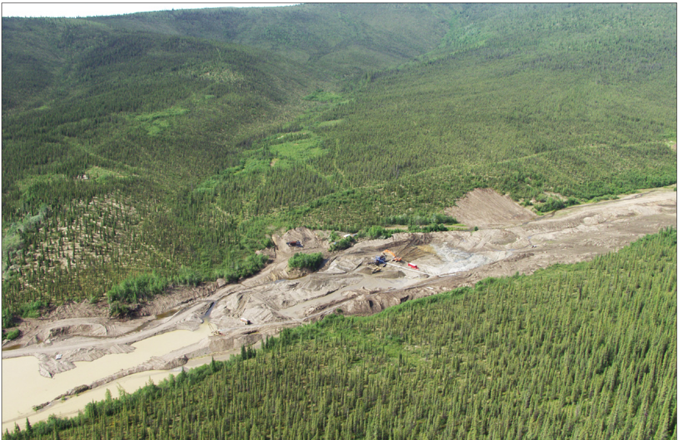
Midas Rex Mining Inc. sluicing on Glacier Creek, 2003.

EQUIPMENT AND WATER TREATMENT In 2003 and 2005, equipment included two Caterpillar D10N bulldozers with U-blades and rippers for stripping, pushing pay to the sluice plant, stacking tailings and testing. A Hitachi EX700 hydraulic excavator with 3½-cubic-yard bucket was used to feed the sluice plant, dig drains and test. A Nodwell-mounted Mobil Drill auger was used for exploration and testing. The wash plant consisted of an 8-foot-diameter Gray Brothers trommel plant with 8-foot-wide, 1- by 1-inch riffles leading to a 24-foot-wide section of expanded metal runs and a 100-foot by 36-inch tailings stacker. The wash plant was driven by a Caterpillar 3306 diesel engine driving hydraulic pumps to power the trommel, stacker and hydraulic winches to position the sluice tables. The plant was mounted on a modified, non-powered Caterpillar 245 excavator track frame and was moved using a tow hitch to a Caterpillar D10N tractor. Water was supplied from Glacier Creek via a large recycle pond, and pumped at 3000 igpm by a Caterpillar 3408 diesel-powered 10- by 12-inch Goulds Model JC pump. The plant processed 250 loose cubic yards per hour. Effluent was settled in-stream, and recycled at 100% due to low water availability. The pond size was 500 by 250 feet (150