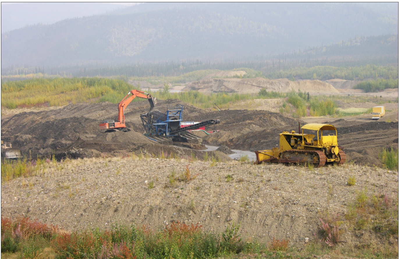
Midas Rex Mining Inc.'s operation on the Sixtymile River, 2004.

EQUIPMENT AND WATER TREATMENT Equipment included two Caterpillar D10N bulldozers with U-blades and rippers for stripping, pushing pay to the sluice plant, stacking tailings and testing. A Hitachi EX700 hydraulic excavator with 3½-cubic-yard bucket was used to feed the sluice plant, dig