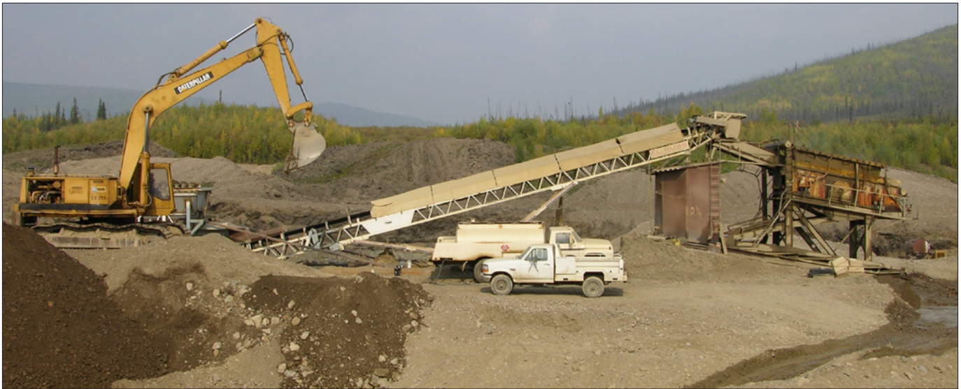
Eldorado Placers Ltd. wash plant on Sixtymile River, 2004.

BEDROCK GEOLOGY Bedrock at this site is fragmented and decomposed schist with localized clay and quartz boulders.