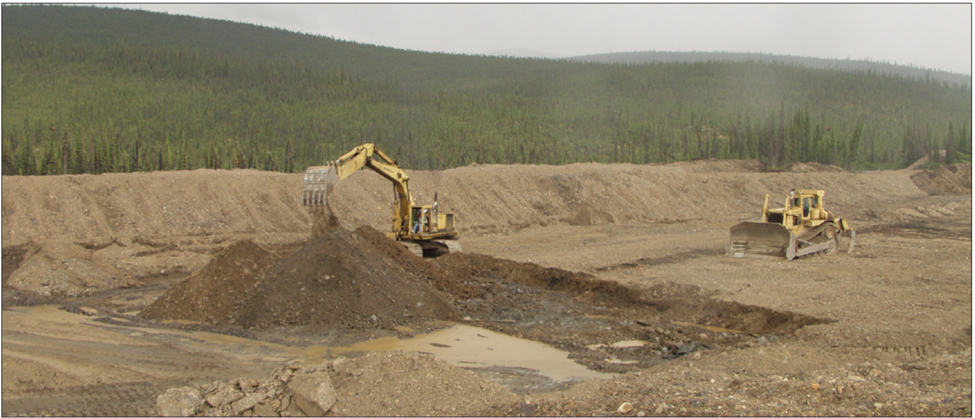
Northway Mining and Exploration Inc. stockpiling pay, Sixtymile River, 2003.

EQUIPMENT AND WATER TREATMENT Equipment included a Caterpillar D9L bulldozer for stripping, a Caterpillar 988B loader to excavate pay and feed the plant, and a Caterpillar 245 excavator to excavate pay. During later seasons, two Caterpillar D550 rock trucks and a Caterpillar D7 bulldozer were added to the operation. The wash plant was a 5-foot-diameter by 20-foot-long trommel that screened material to \frac{5}{8} inch. The sluice runs were 14 feet wide by 7 feet long with pulsating riffles. Process water was 100% recycled in mined-out cuts. The typical pond size was 300 feet (100 m) wide by 600 feet (200 m) long. A long drain discharged groundwater seepage to the Sixtymile River.