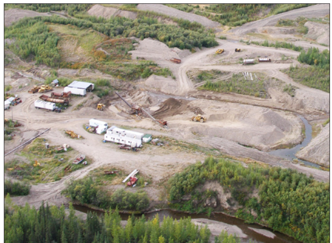
Prohaszka's operation on Big Gold Creek, 2005.

GOLD CHARACTERISTICS In 2003, the gold was 10% fine grained and the fineness was 804. In 2005, the gold was 65% fine grained and the fineness was 804.