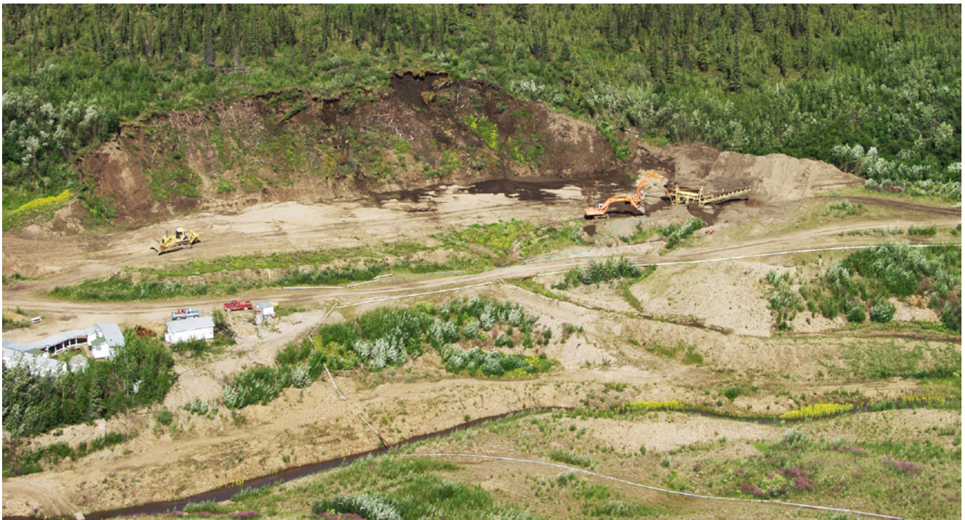
Tri Kay/Hawker mining on left-limit bench of Sixtymile River, 2003.

EQUIPMENT AND WATER TREATMENT Equipment consisted of a Hitachi EX300LC excavator with a 2-cubic-yard bucket for