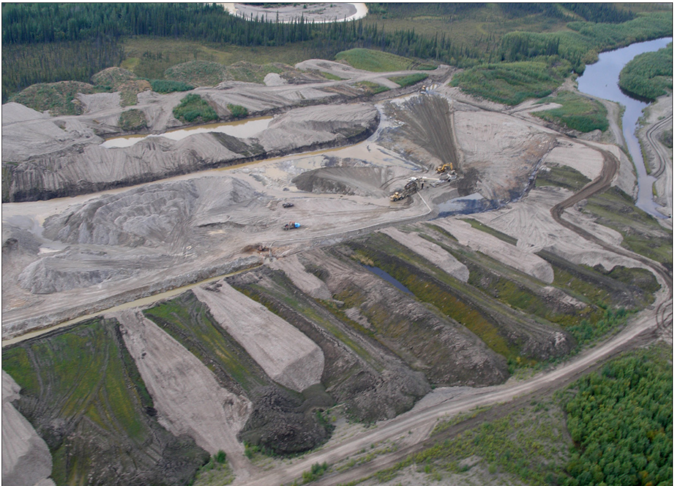
Aerial view of Eldorado Placers/Hawk Mining's pit on Sixtymile River, 2005.

SURFICIAL GEOLOGY AND STRATIGRAPHY The stratigraphic section consisted of 9 to 15 feet (3 to 5 m) of muck overlying 12 feet (4 m) of gravel. A total of 3 feet of gravel (1 m) and 3 feet (1 m) of bedrock were sluiced.