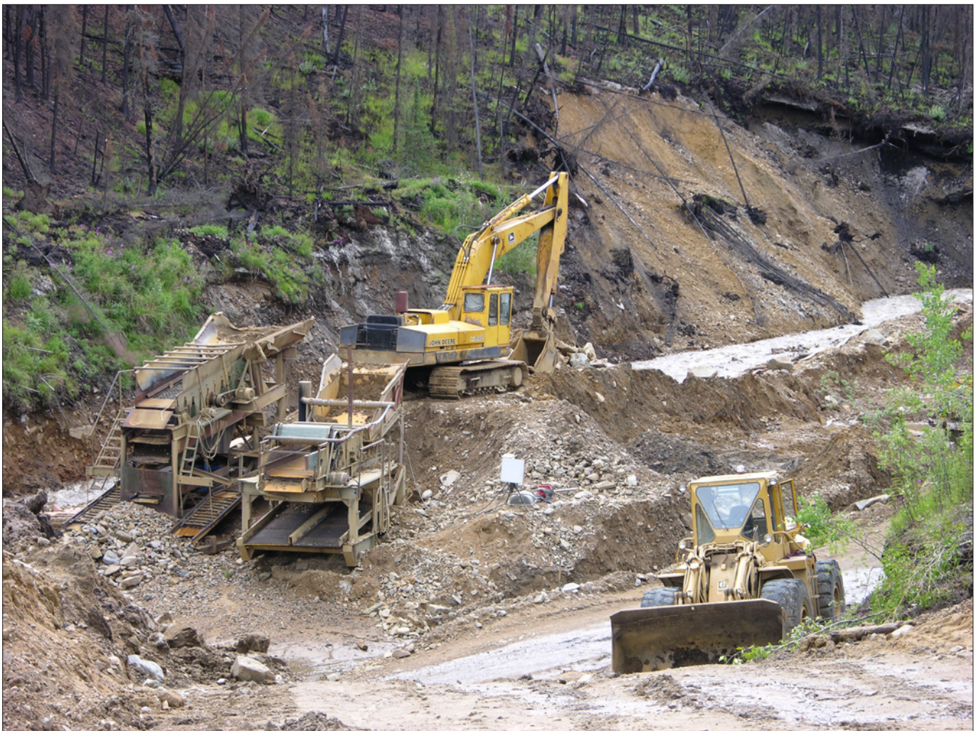
Right Fork Mining's operation on Mechanic Creek, 2005. The Gow family sometimes fed Hank Febr's plant as well as their own.

GOLD CHARACTERISTICS From 2001 to 2005, the gold was a mixture of wire gold and round balls up to 0.2 oz (6 grams) and nuggets with a range in sizes. Some gold had quartz attached. Approximately 50% to 60% was 40 to 50 mesh, 20% was 20 mesh, and 20% to 30% was from minus 80 to minus 200 mesh. The fineness was 870 to 900.