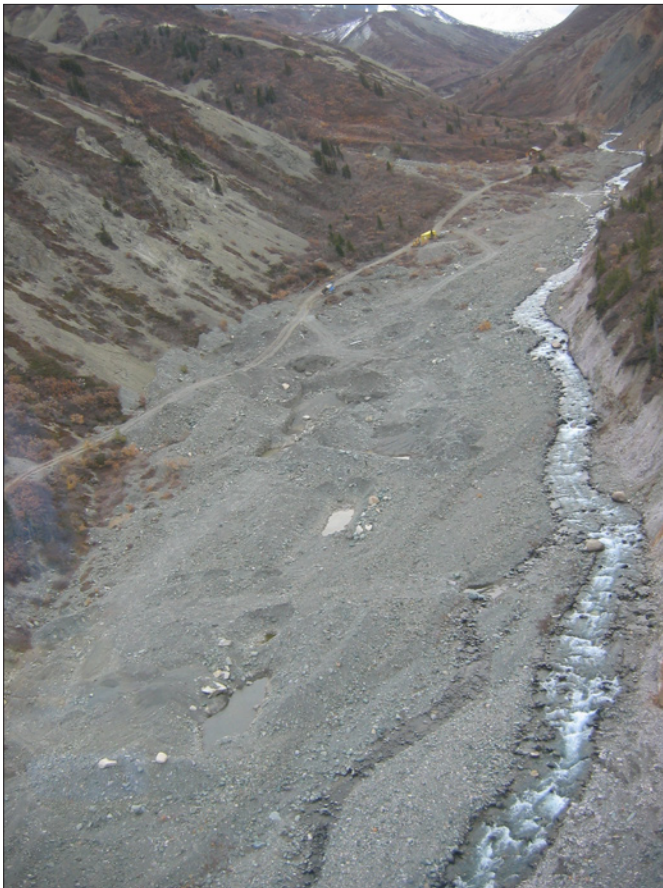
Keller and Marty's mining pits on Kimberley Creek, 2005.

EQUIPMENT AND WATER TREATMENT In 2004, a Caterpillar 931 backhoe was used to construct settling ponds and conduct limited testing. In 2005, a Link-belt 210 excavator was added and both machines were used for stripping and excavating. The recovery system consisted of a trommel and a jig. Water was pumped by a gas-powered Honda supplying 330 igpm, enough to process 20 loose cubic yards per hour. Water was