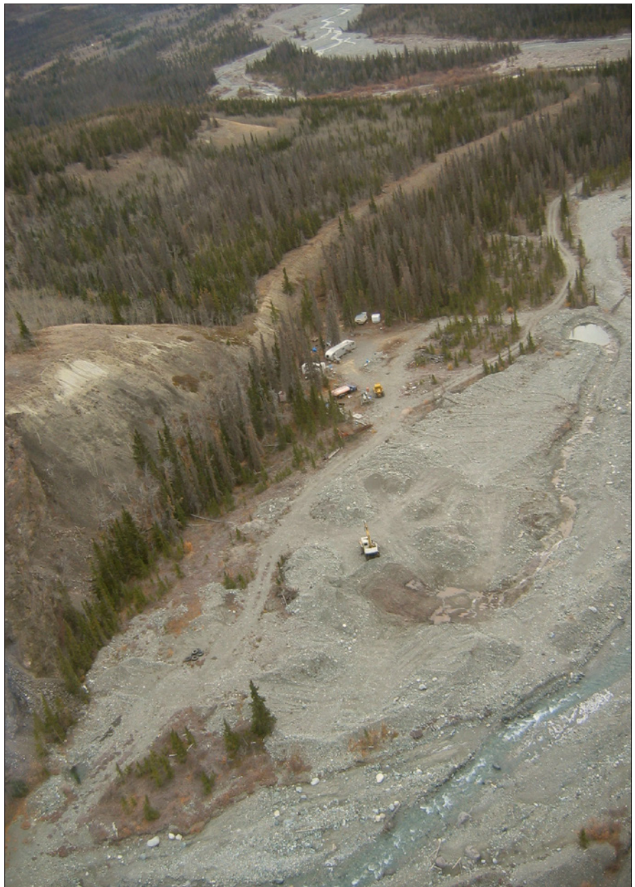
Burton's test operation on Telluride Creek, 2005

BEDROCK GEOLOGY Bedrock is mapped as various volcanic rocks, breccia, limestone, conglomerate and phyllite.