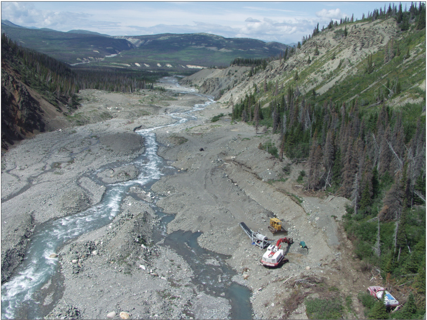
Claire and Pat Sawyer's mining operation on Kimberley Creek, 2003.

6 inches to 4 feet (0.2 to 1 m) of the lower gravel were sluiced along with 1½ feet (0.5 m) of bedrock.